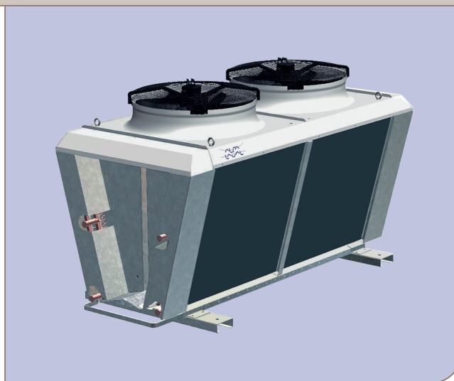
Alfa-V Single Row