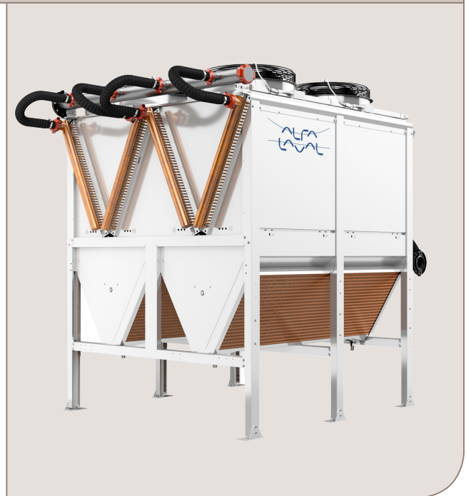
Alfa Laval Abatigo adiabatic liquid coolers