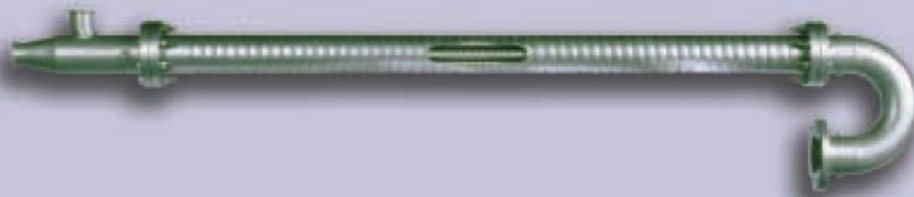
ViscoLine Regenerator with open sectional view

The tubular heat exchanger series from Alfa Laval